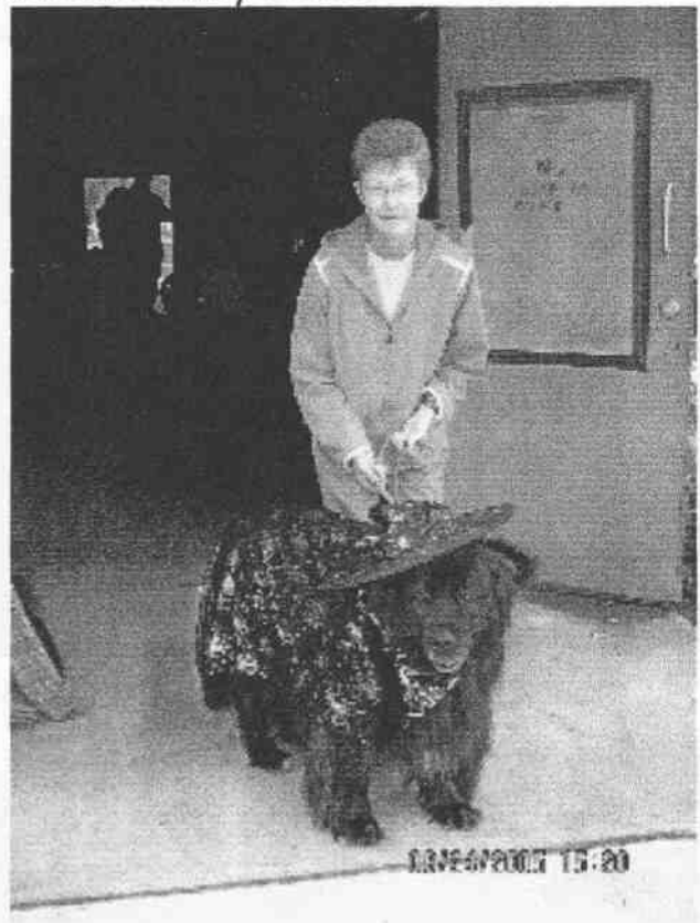
Mary's Sapphire dressed as a witch?