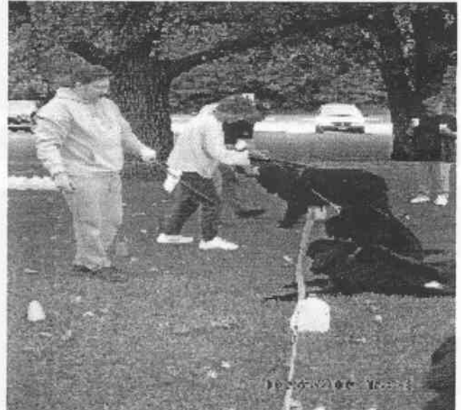
Getting ready for the jug haul contest.