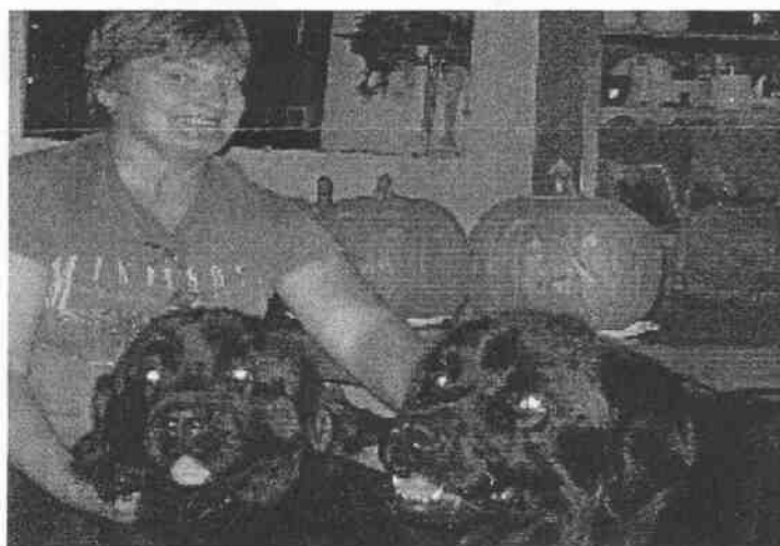
2 Big black dogs and their pumpkins

April 23rd - River King Newf.Club, Alton, IL, Newf. Draft Test