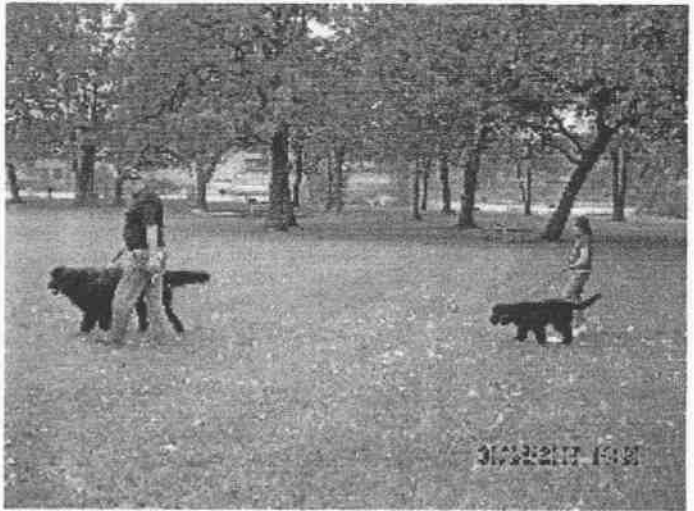
Musical Chairs (Pie Plates) is an annual riot to play!

Who will find the lucky plate to sit on?