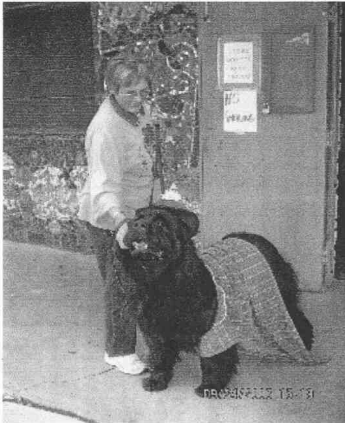
Judy's Ebony dressed up in classy duds!