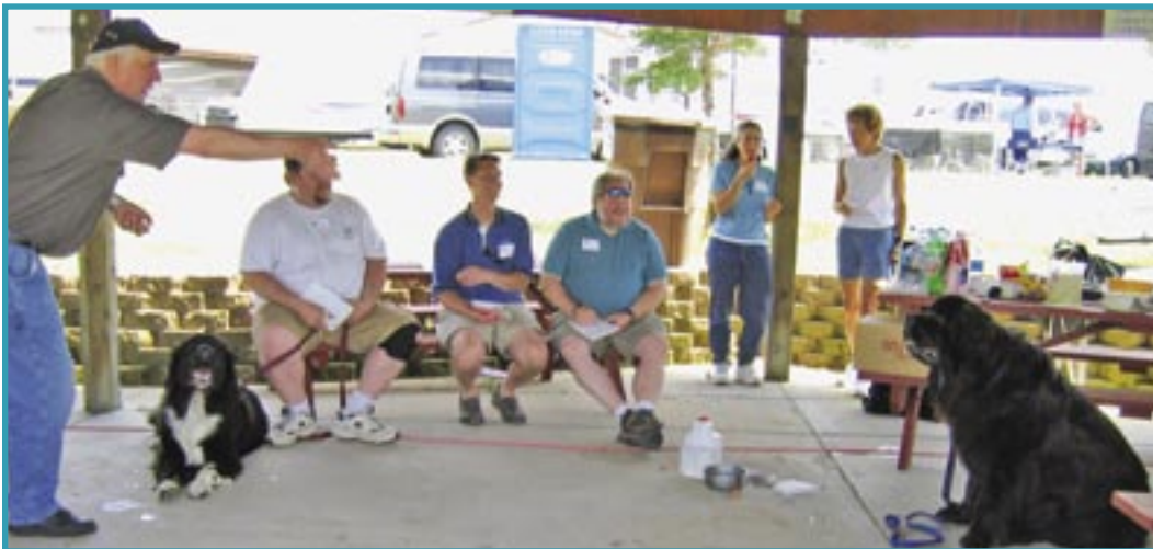
Our first event was the Hot Dog Toss. Look at the concentration needed for this fierce competition.