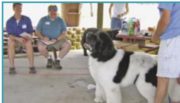
Wait for it...wait for it.