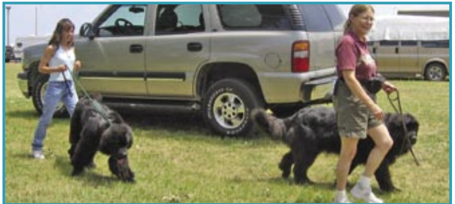
Opening ceremony parade at the Newf Olympics.