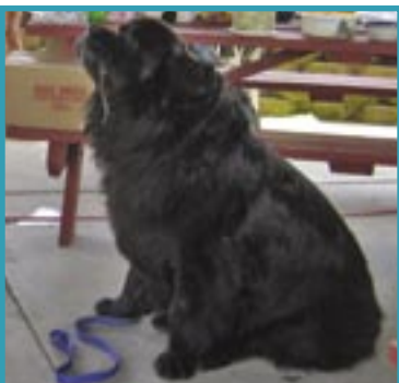
Newf's drool...I mean rule.