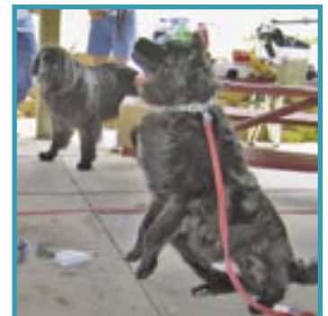
This one is mine.