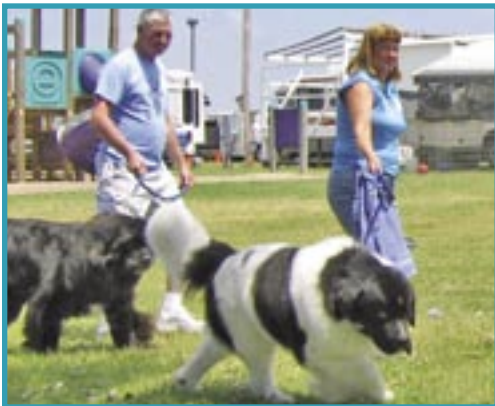
Ready for the games to begin.