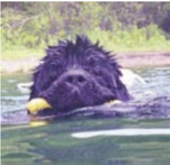
To the rescue with a life ring

Come prepared to learn, to have a good time with your dog and other Newfy owners...and to get wet !!