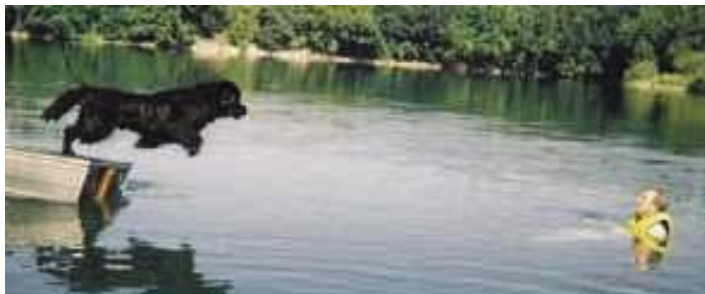
"Don't worry, I'll save you!"