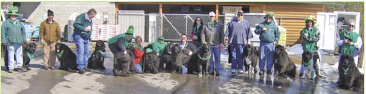
We had a great turnout at the St. Patrick's Day Parade.