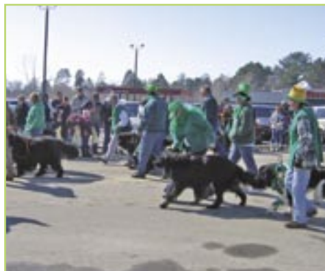
Walking in the parade.