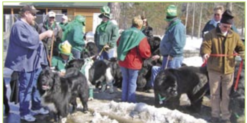
Waiting for the parade to begin.