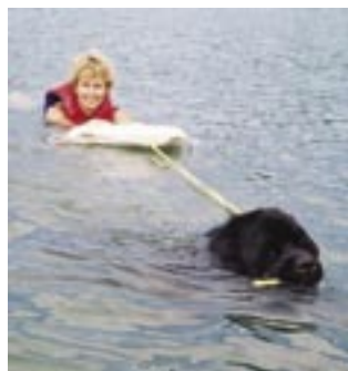
"I'll take you to shore"