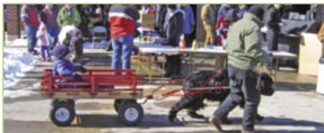
Above: The start of the parade. Below: Priscilla Zellar with Trooper, giving out rides.